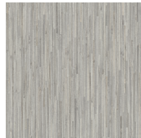
Wander VTX20828592 Pattern Repeat L100 x W99.5 Drop 1/2