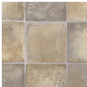
Palermo VTX5626936 Pattern Repeat L100 x W99.5 Drop 3/4