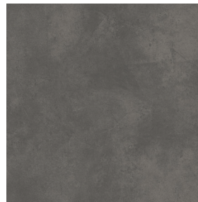
Bari VTX20028594 Pattern Repeat L100 x W100 Drop 1/2 Reverse Lay