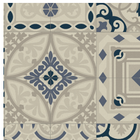
Shalimar VTX20928579 Pattern Repeat L100 x W99.5 Drop 1/3