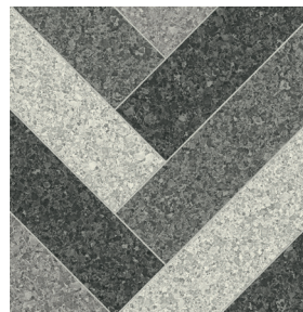
Veneziana VTX20726597 Pattern Repeat L100 x W199 Drop 1/2