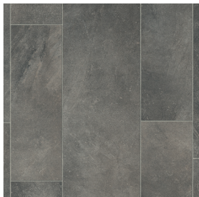
Minos VTX15728596 Pattern Repeat L100 x W100 Drop 1/2