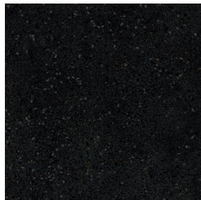
Sorrento VTX20526599 Pattern Repeat L100 x W99.5 Drop 1/2 Reverse Lay