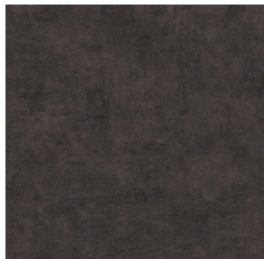
Odin VTX17026596 Pattern Repeat L100 x W99.5 Drop 1/2 Reverse Lay